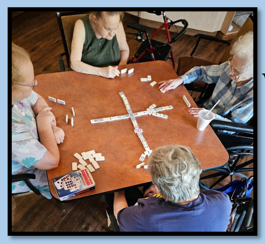
LIVE MUSIC WATERMELLON DOMINOS & FURRY FRIENDS