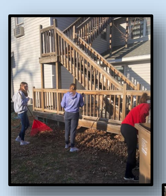
Raked up a dozen dumpsters full of leaves.