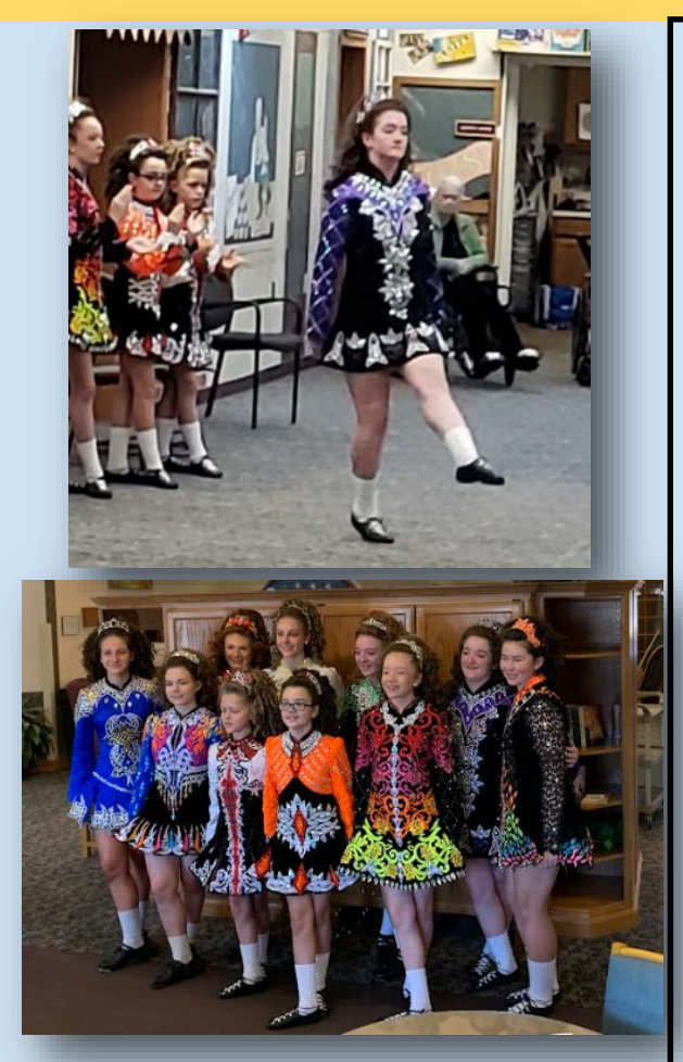
Irish dancers came to entertain our residents

Saint Patrick's Day Menu and All Day Party Day Mar 17, 2023 Make sure you are wearing Green