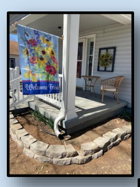
Laid landscape stone like this in 5 different areas.

Work projects are fun & humbling as we are reminded in the scriptures to do for others as we would do for ourselves.